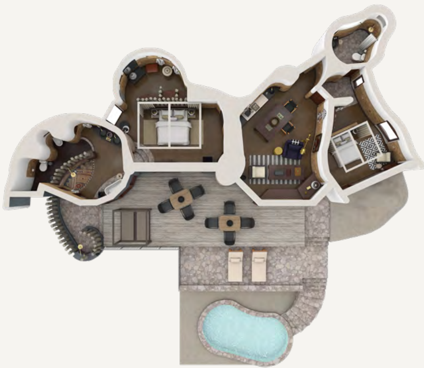
2 X TWO-BEDROOM SUITES

*Suitable for three adults or two adults and two children.