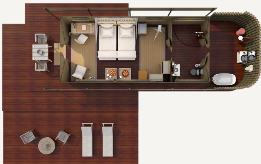
4 X ONE-BEDROOM TENTS