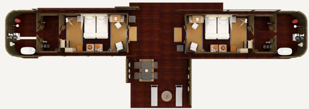
2 X TWO-BEDROOM FAMILY TENTS