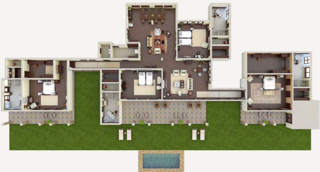
1 X FOUR-BEDROOM COTTAGE