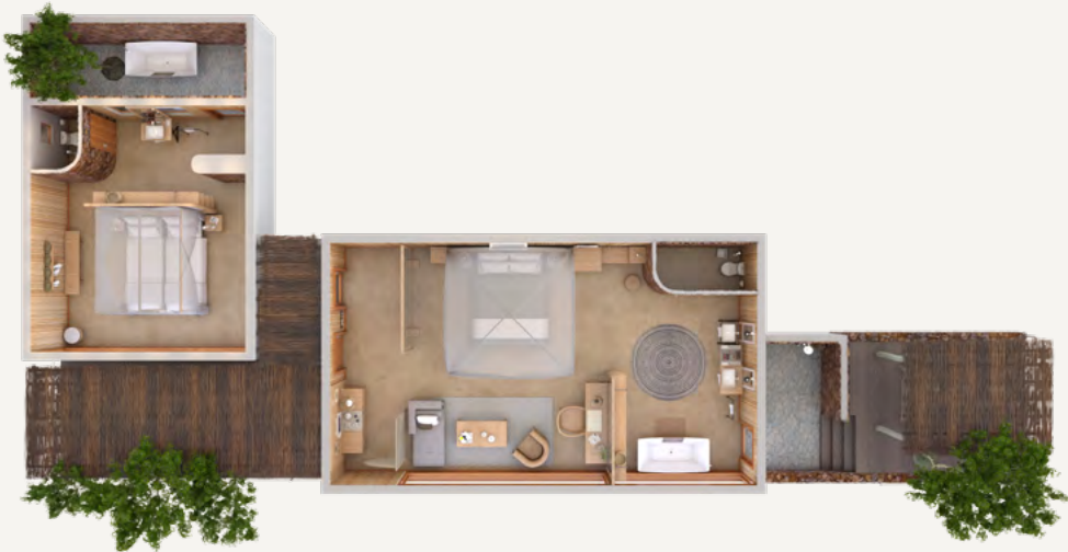
1 X FAMILY SUITE