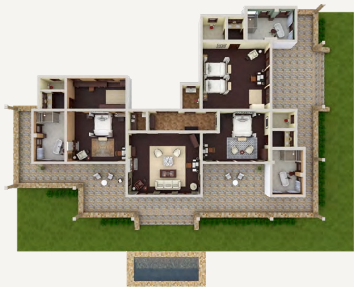
1 X THREE-BEDROOM COTTAGE