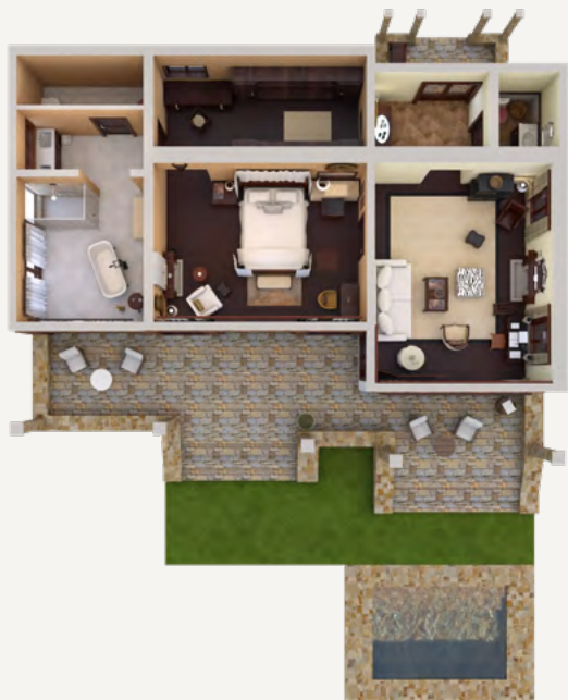
6 X ONE-BEDROOM COTTAGES