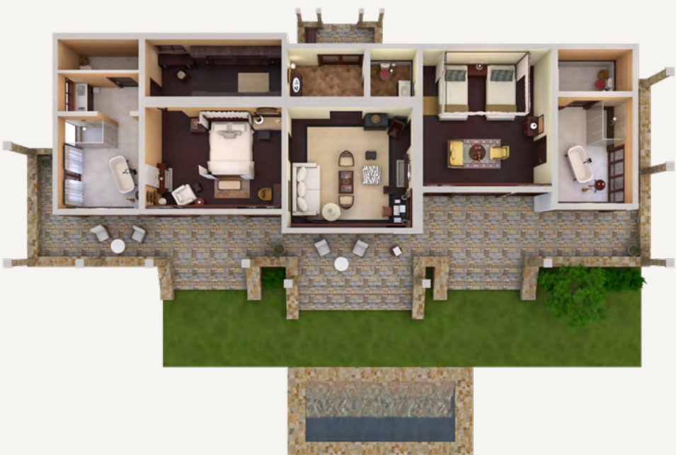
2 X TWO-BEDROOM COTTAGES