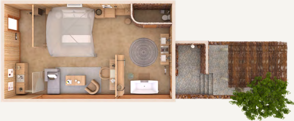
7 X ONE-BEDROOM SUITES